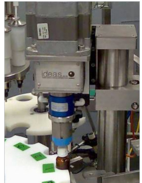
The capping unit installed in production.

At this operating capacity the unit provides a range of production and diagnostic data previously not available, to be recorded and stored.